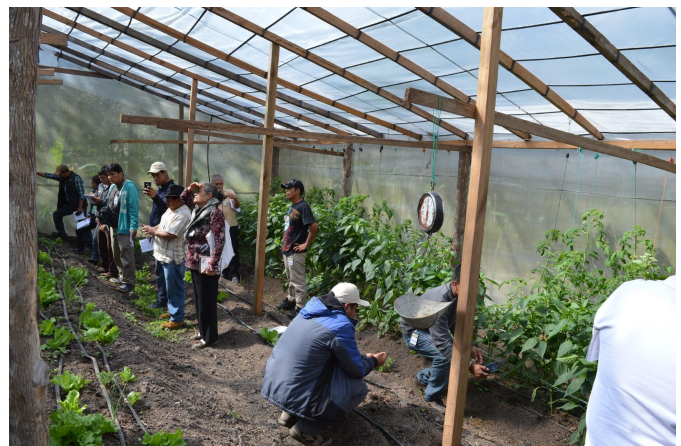
COMSA's Diplomado Organico event. Marcala, Honduras.