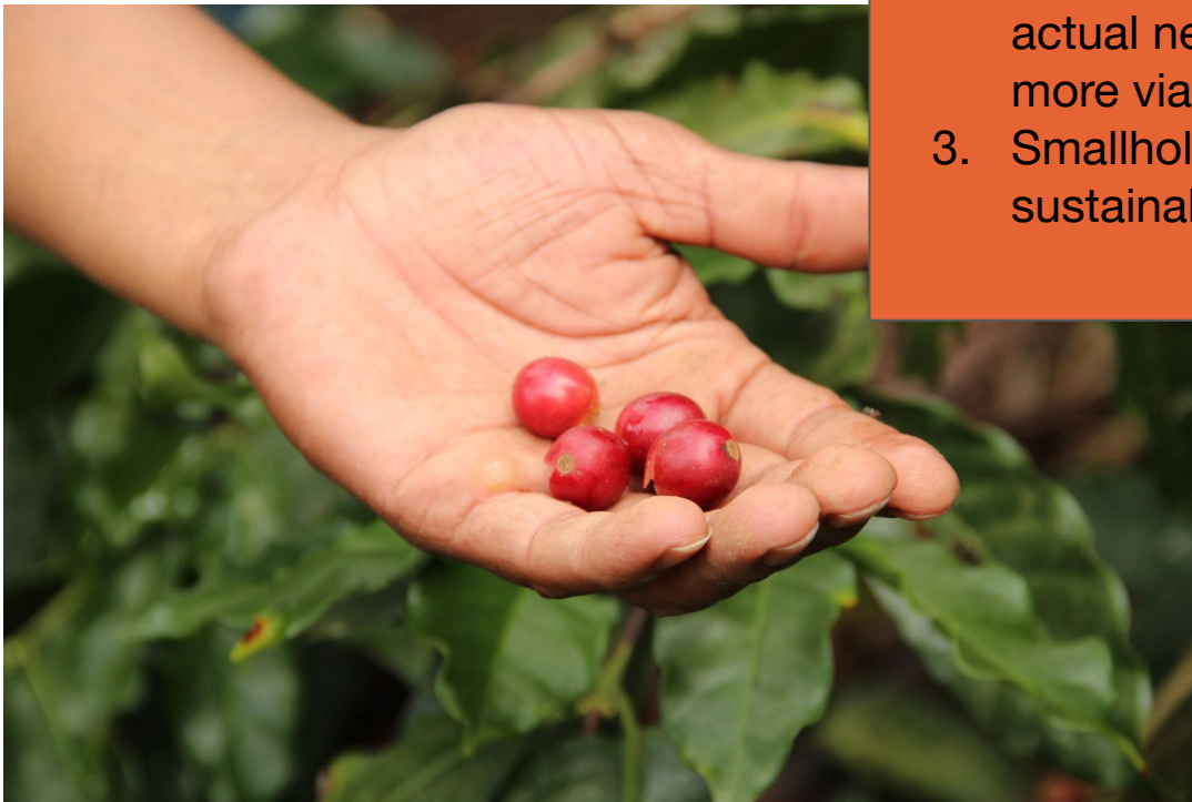
Coffee Cherries.