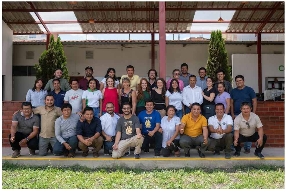
Right: Group photo of participants at a Cooperative Coffees conference at the CENFROCAFE processing plant. Jaén, Cajamarca, Peru.